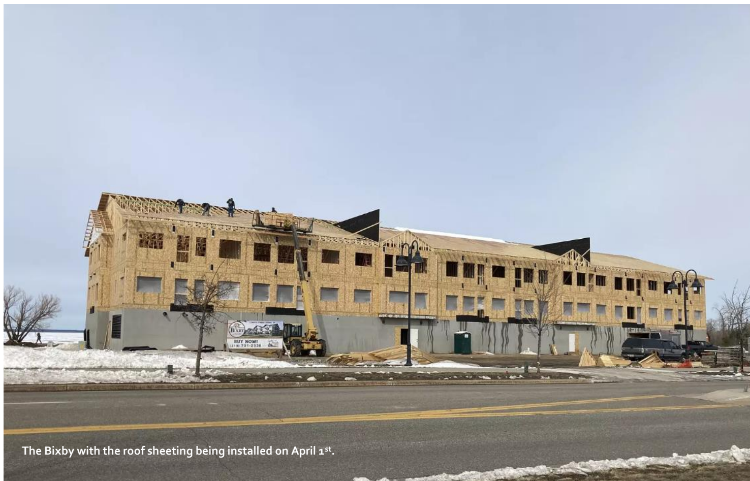
The Bixby with the roof sheathing being installed on April 1 st .