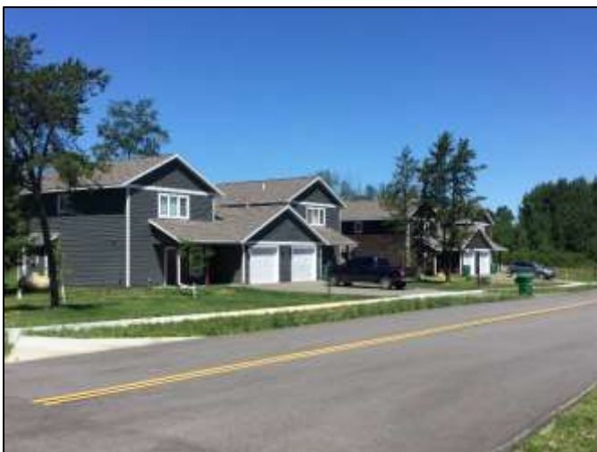
Photo: Great Western Properties Twin Homes